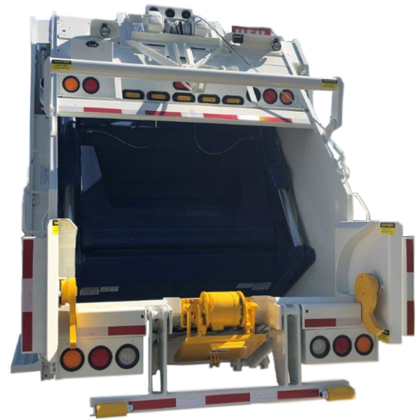
QWIK-TIP Rear Load Truck

THE ROTAC ® BEAST TIPPER IS THE ONLY CART TIPPER ON THE MARKET TO FEATRE THE MICROMATIC ROTAC ® ROTARY VANE ACTUATOR - ITS SIMPLE YET EFFICIENT DESIGN FEATURES ONLY ONE MOVING PART!